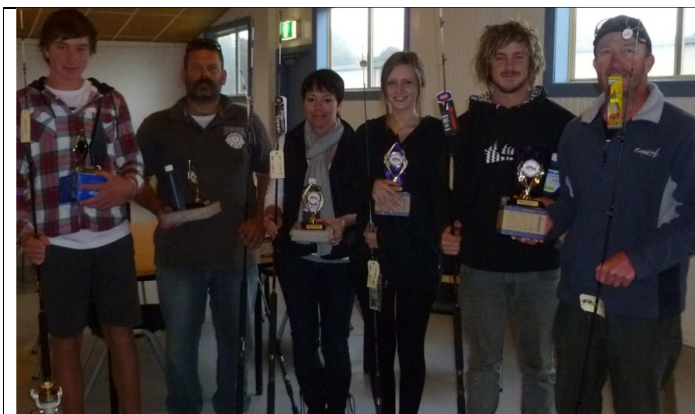
2010 – 2011 winners